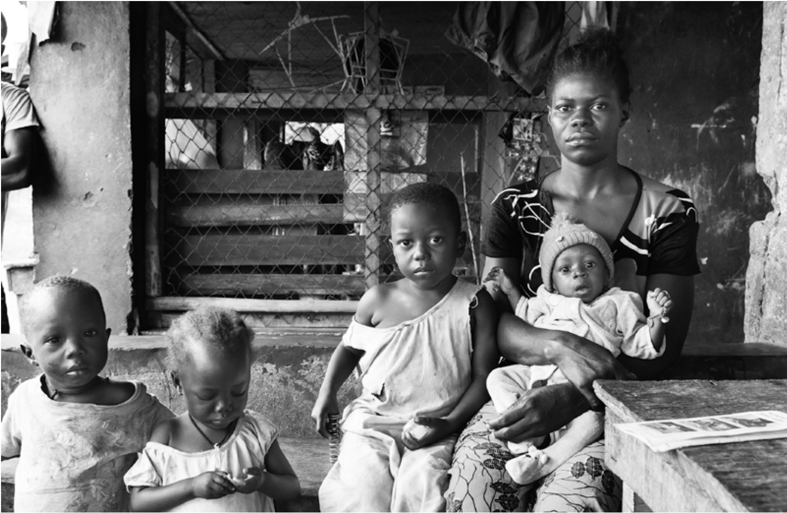
This image of a Sierra Leone mother and her family was one of 10 photos in a National Geographic "End Poverty" exhibit at the World Bank Headquarters in Washington, D.C.

spoke with her and learned her children eat only about one meal a day, consisting solely of rice. She was concerned about the health of her young children and let me take her photo."