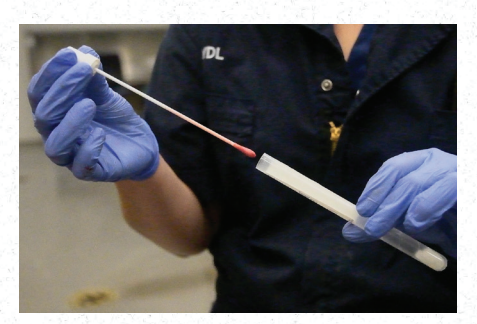
6. Place the swab into a labeled, sterile tube. Promptly refrigerate samples for shipment and submit to a veterinary diagnostic laboratory.