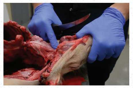
3. Flex the head up and down to identify the "yes" joint (atlanto-occipital joint).