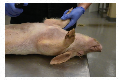
1. Place the pig on its back (dorsal recumbency).