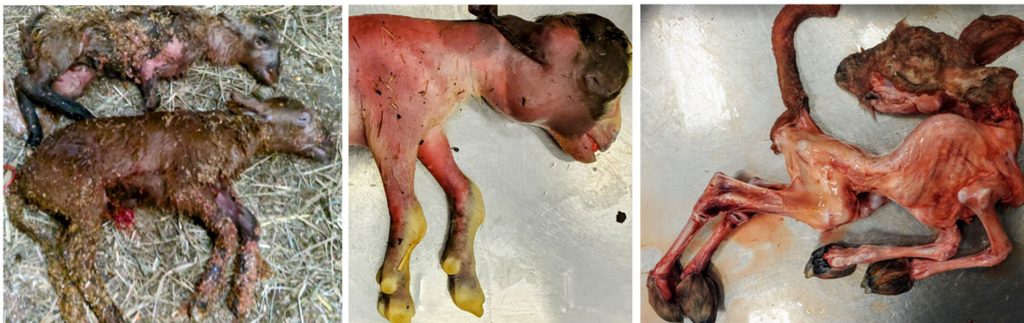
Figure 2: Examples of etiologically significant findings in fetal gross examination. Left: Asynchronous fetal death with presentation of a full-term stillborn fetus and a partially mummified immature twin associated with a Toxoplasma infection. Middle: Full-term fetus with sparse haircoat, superior brachygnathia and prominent bilateral firm enlargement of the thyroid (goiter) due to gestational iodine deficiency. Right: Fetus with arthrogryposis and scoliosis. Skin has been removed to demonstrate profound denervation muscle atrophy as a consequence of Cache Valley Virus infection.