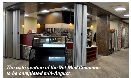
The café section of the Vet Med Commons to be completed mid-August.

The Thursday night reception on Sept. 20 will be held in the newly renovated Vet Med Commons at ISU. IVMA members will also have access to the new Pet Cancer Center and Stereotactic Radiation Therapy service, and other new areas of the college and hospitals.